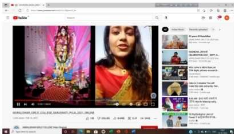
ONLINE SARASWATI PUJA