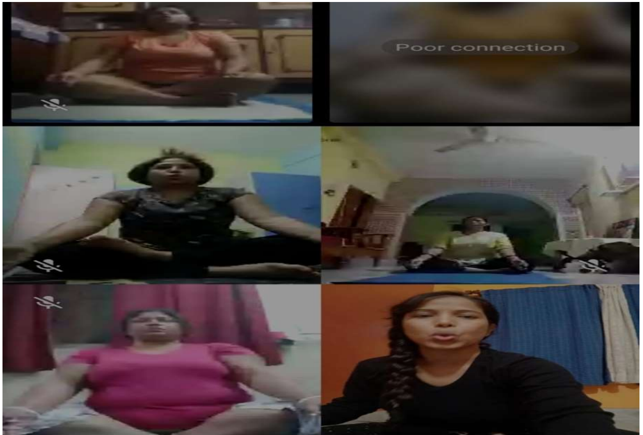
ONLINE YOGA CLASS