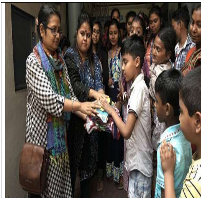
Muralidhar Girls' College National Service Scheme