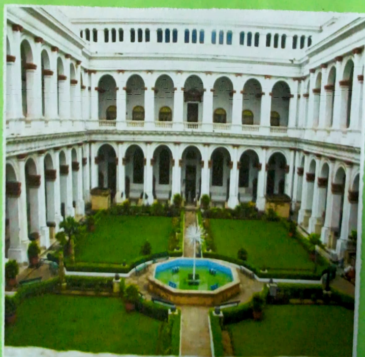
The Indian Museum, Kolkata