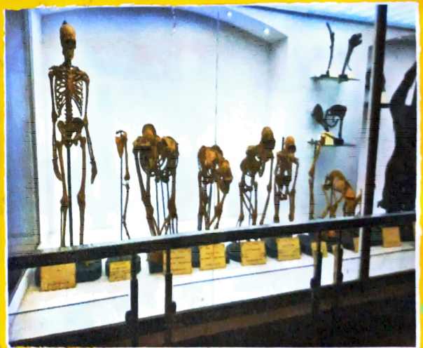
Evolution of man