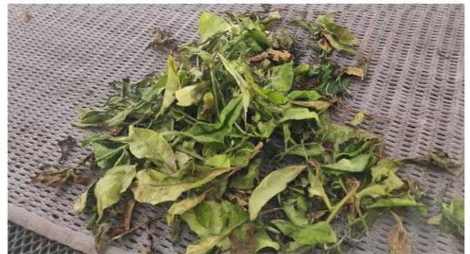
Tea leaves kept for drying