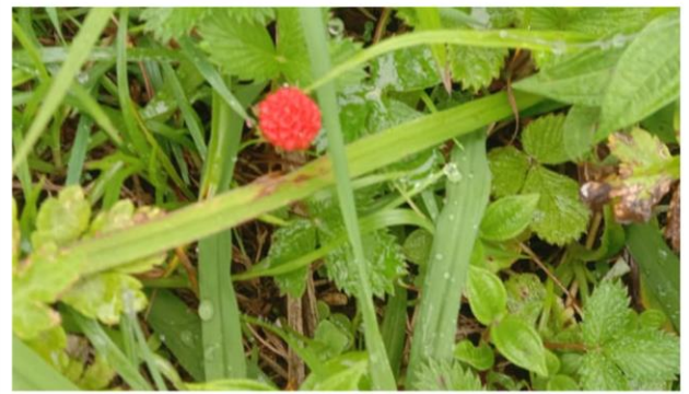
Fragaria vesca (Rosaceae) at Takdah