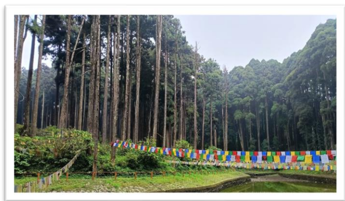
Lamahatta Eco Park