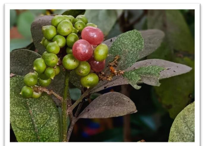
Glycosmis pentaphylla with Berry (Type of fruit)