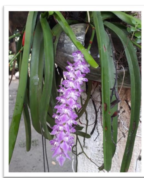
Rhynchostylis retusa (Orchidaceae) at Chalsa