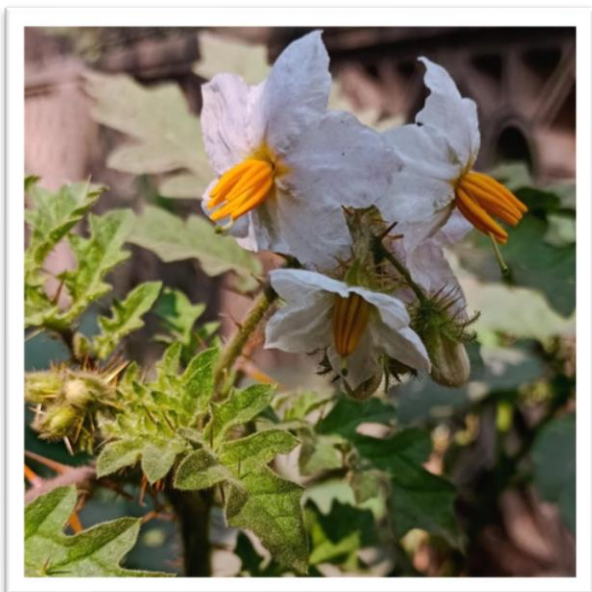
Solanum sisymbriifolium (Wild Brinjal)