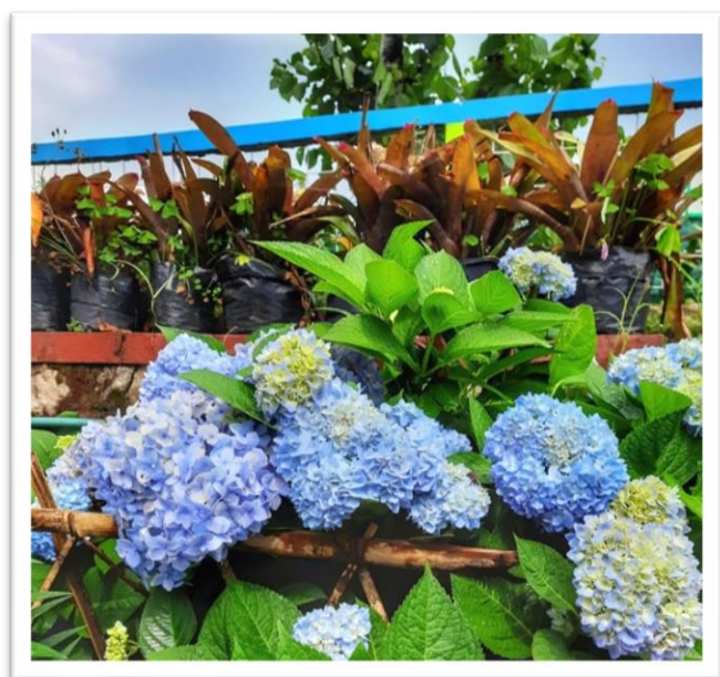
Hydrangea macrophylla (Hydrangeaceae) at Chota Mangwa