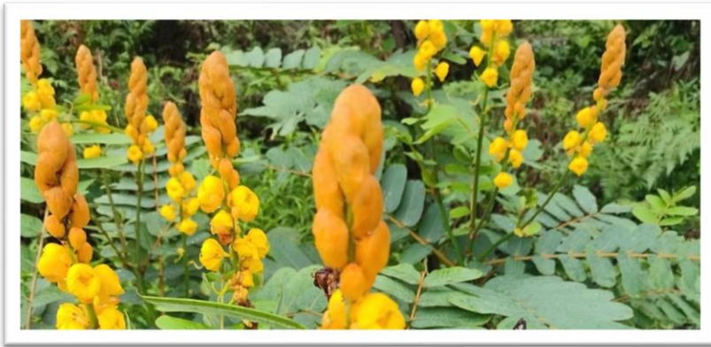
Cassia sophora (Fabaceae) at Chalsa