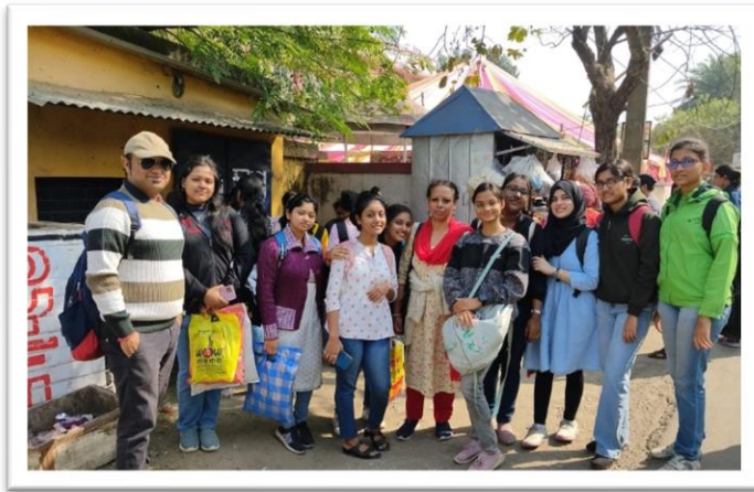
Group photo on way to New Garia