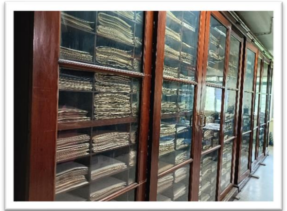
Central National Herbarium