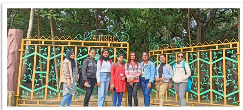
Group Photo (Great Banyan Tree Entrance)