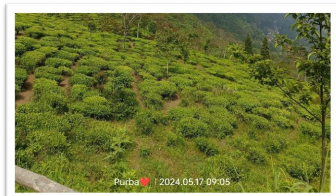
Tea Garden (Tinchuley)