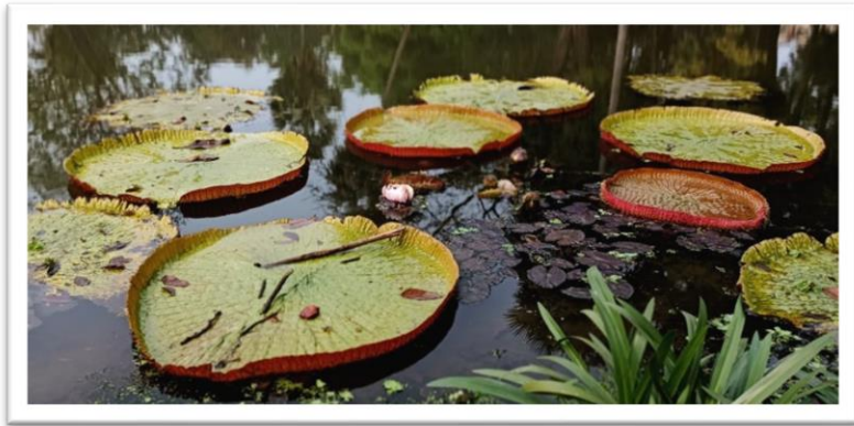
Giant Water Lily ( Victoria kruziana )