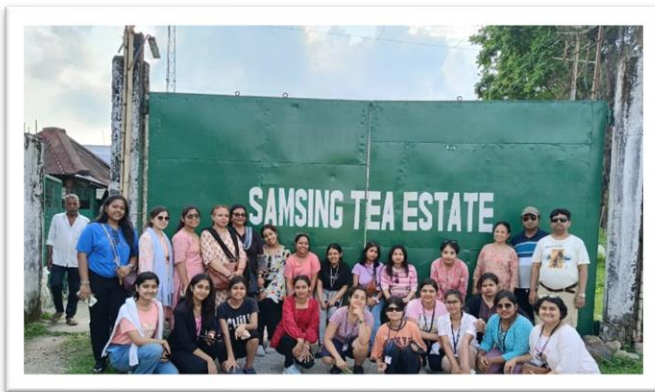
Group photo in front of estate gate