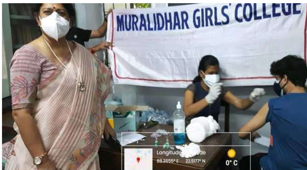
Muralidhar Girls' College "Covid-19 Vaccination Drive"

Any other information regarding Institutional Values and Best Practices which the institution would like to include.